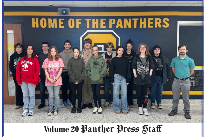
Volume 20 Panther Press Staff