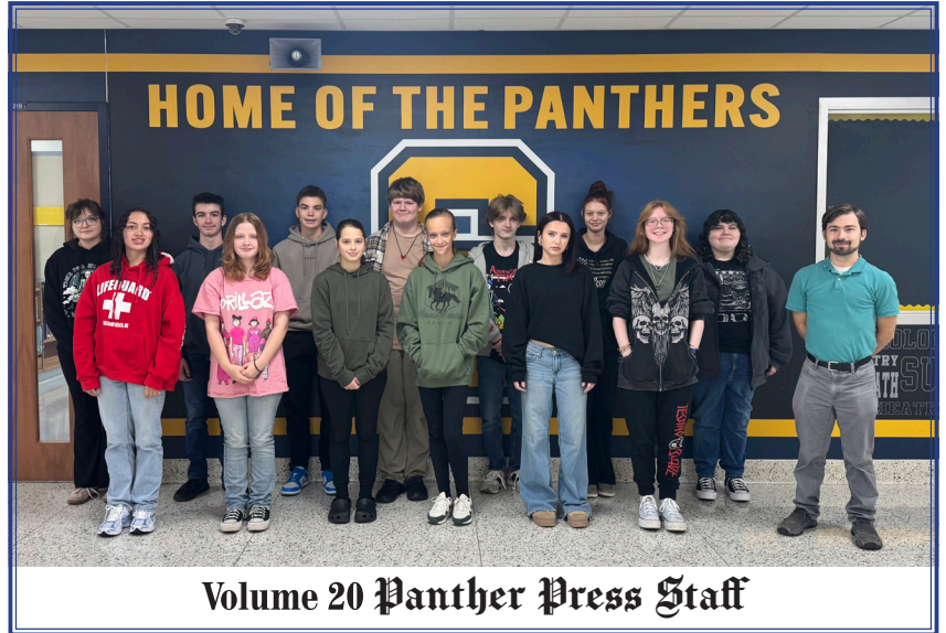
Volume 20 Panther Press Staff